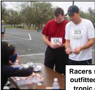
Racers shoes were outfitted with electronic chips that tracked their times.