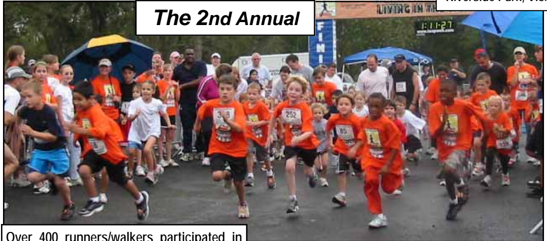
Over 400 runners/walkers participated in the race (including at least 60 children). Some came from as far away as Dallas. The rain held off until the races were over.

The 5K Walk/Run raised $15,621.33 after expenses for Hospice of South Texas!